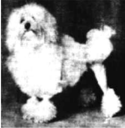
Quinbury Fiesta Fashion