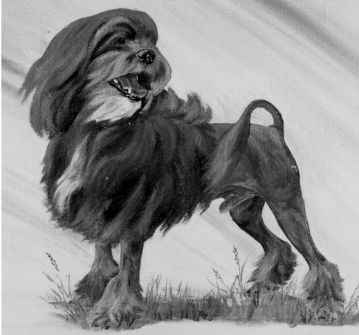
Irish Ch. Evening Echo CD.