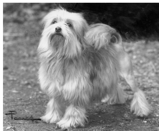
Ch. Littlecourt Gregi.