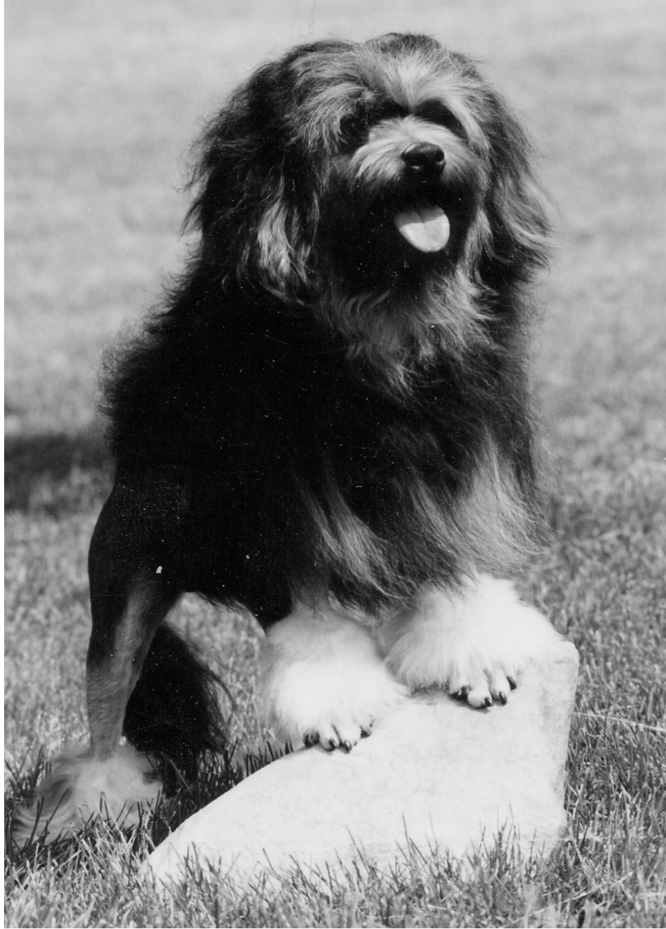
Duncara's Mulligan Masterpiece.