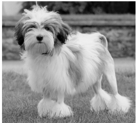
Grestean Chickadee Chucle.