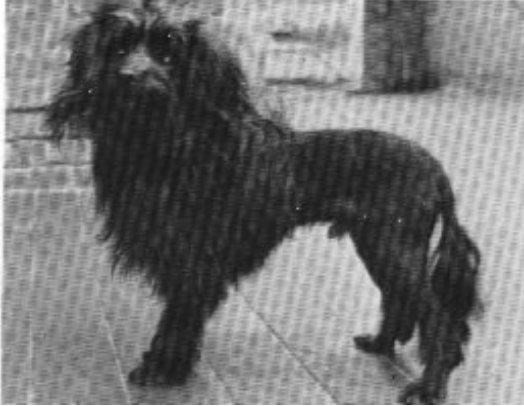
Cherrycourt Hit von den Drei Lowen.

Löwchen have captured hearts the world over. The early imports of Löwchen into Great Britain began what culminated into British dominance of the breed. It was the British breeders who focused world attention on the Löwchen. Their success in developing the breed and promoting it overseas helped bring the Löwchen back