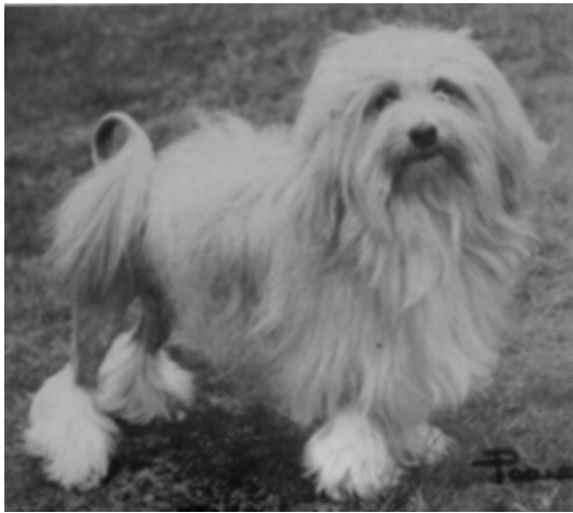
Ch. Hanovarian Boughton by Jove of Chensive.