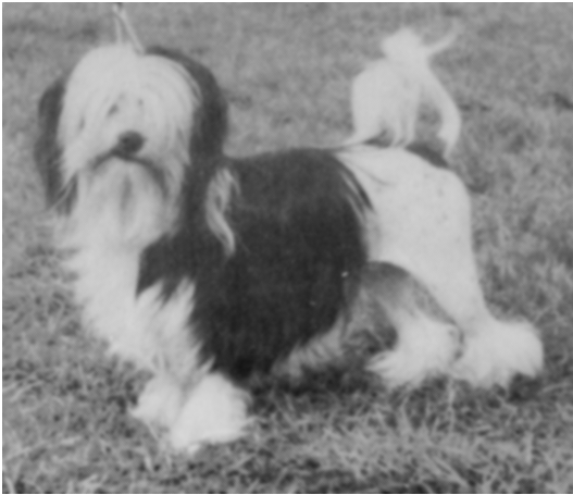
Ch. Cleevview Painted Lady.

Besides Löwchen she is authorized to judge 30 other breeds from six different groups, as well as Best in Championship Show