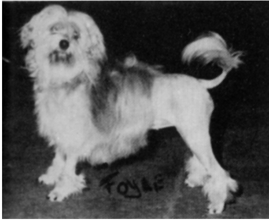
Cluneen Umber Upupa of Grestean.