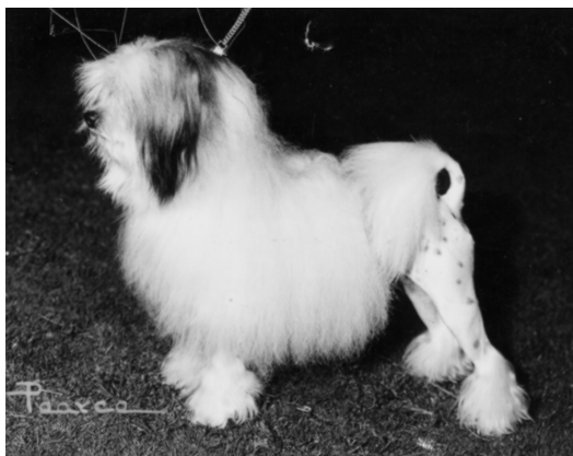
Ch. Cleevview Gunther of Littlecourt