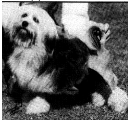
Duncara Whistling Willie