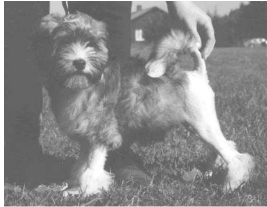
Hanovarian Sinner as a puppy