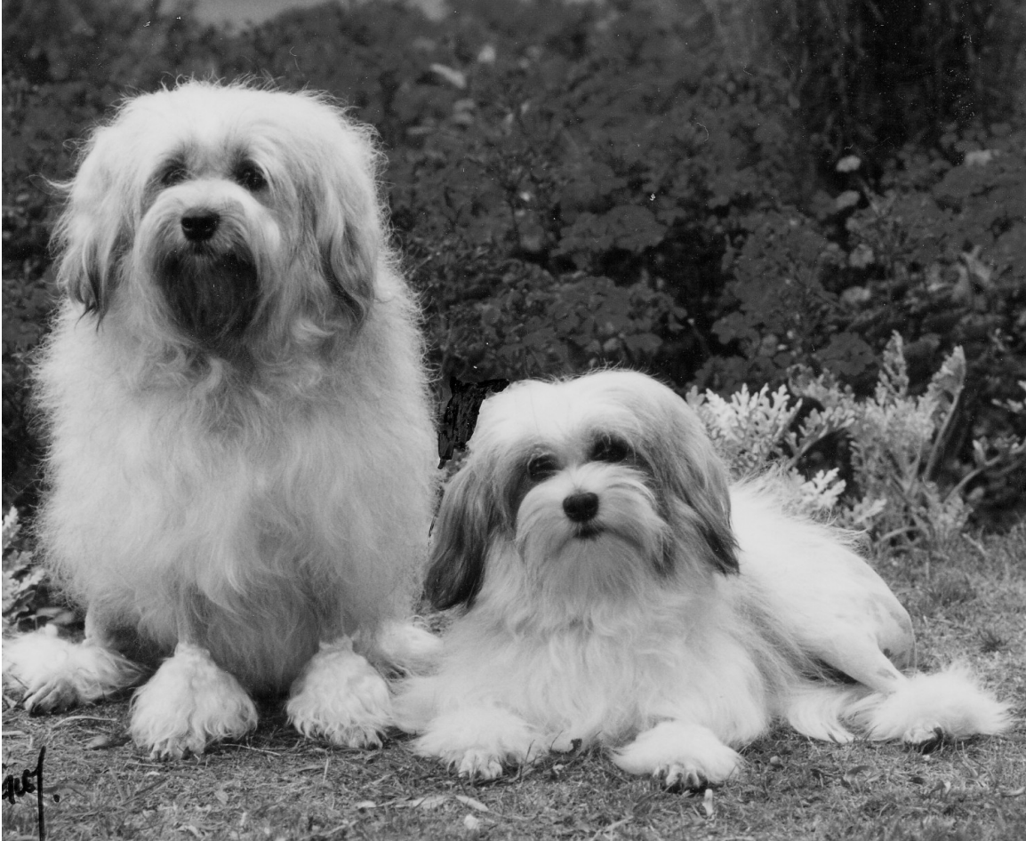
Melfield Iora in Grestean and Grestean Chickadee Chucle. These dogs are descendants of the Grestean foundation bitch Cluneen Umber Upapa of Grestean.