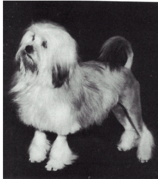
Duncara Holly Go Lightly.