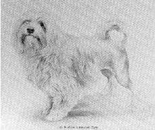
Duncara Ice Blink