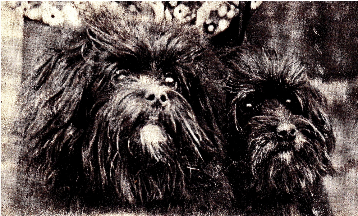
Cherrycourt Hit VD3 Lowen & Cherrycourt Charlotte V. Livland.