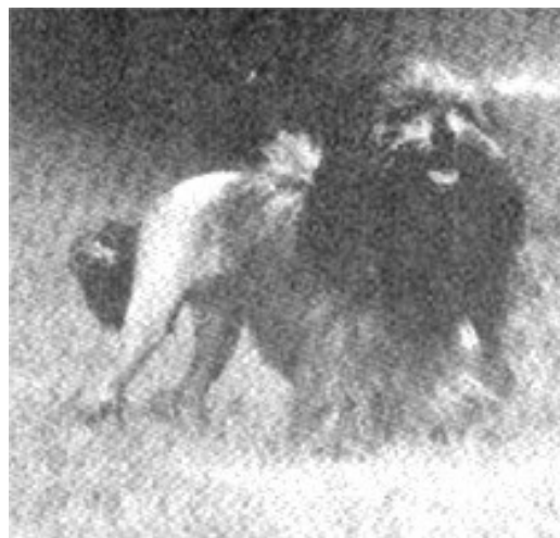
Duncara Zipity DoDah