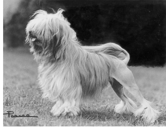
Ch. Littlecourt Acajou, Best in Show 1983 Löwchen Club Specialty Show.

There were over one hundred Löwchen registered under the Cluneen prefix. Cluneen dogs played a large part in establishing Löwchen around the world. There are few countries where the foundation stock does not include Cluneen dogs in their pedigrees. Cluneen Adam Adamant was one of the most famous.