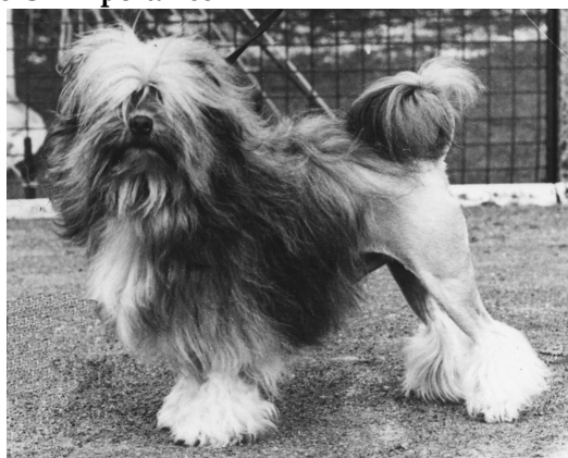
Ch. Littlecourt Pippin. First Löwchen to gain Junior Warrant as well as first Littlecourt dog champion.