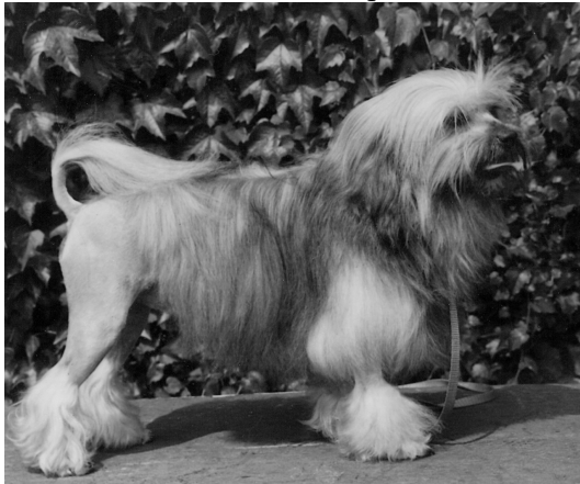
Ch. Duncara Victorian Extra.