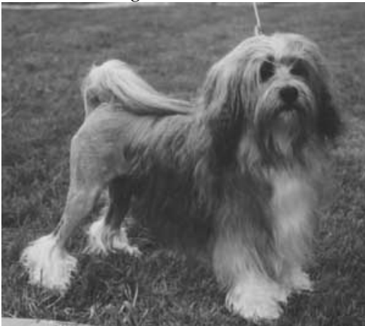
Hanovarian Sinner.