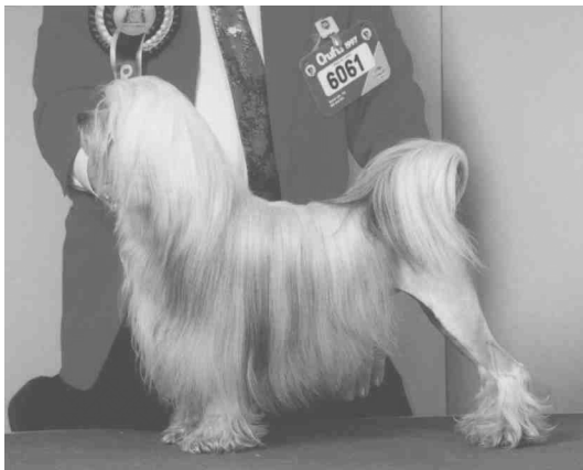
Brahms & Lizt