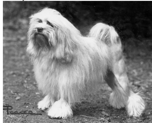
Ch. Balatina Bonwillwn BWGI.